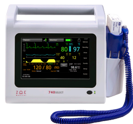
FILAC 3000 Predictive Temperature