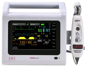
Exergen Temporal Artery Scanner

FILAC™ 3000 Predictive or Exergen TemporalScanner™